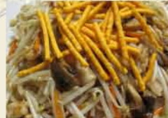
Chicken Chow Mein

4 Egg Rolls Sweet & Sour Chicken Balls Beef with Vegetable & Almond Chicken Chow Mein Breaded Shrimps Chicken Fried Rice