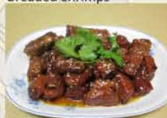
Honey Garlic Ribs