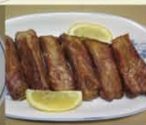
B.B.Q Dry Ribs