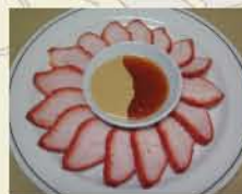
B.B.Q Pork Slices