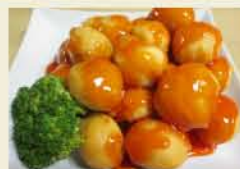
Sweet & Sour Chicken Balls

2 Egg Rolls Chicken Chow Mein Sweet & Sour Chicken Balls Chicken Fried Rice