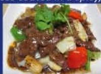
Black Pepper Beef

An authentic gourmet Chinese specialty dish with crispy breaded chicken pieces coated in a spicy, sweet & sour sauce!