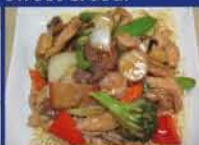
Cantonese Chow Mein