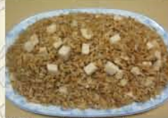
Chicken Fried Rice

3 Egg Rolls Sweet & Sour Chicken Balls Beef with Vegetable & Almond Chicken Chow Mein Chicken Fried Rice