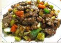
Beef Vegetable & Almond

5 Egg Rolls Chicken Chow Mein Beef with Vegetable & Almond Breaded Shrimps Sweet & Sour Chicken Balls Chicken Fried Rice Tai Dop Voy