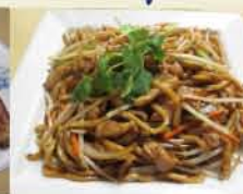
Chicken Shang Hai Noodles